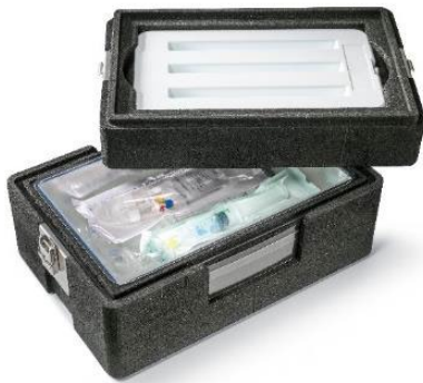
Figure 01: The Onco-System, the new sector-specific solution for pharmacies and laboratories, is designed to facilitate the transportation of cytostatic agents and other vital, temperature-sensitive medications in IV bags.

clinicians to use and pack the boxes. What's more, the system solutions consist of a small number of coordinated components that can be used repeatedly and, if necessary, reordered individually at any time. If the box needs to be replaced, the cooling packs and closures can still be used. Both the Onco-System and Clinic-System are now available in two different sizes: the Onco-System comes with a useful volume of either 17 liters or 30 liters; with the Clinic-System, customers can choose between a useful volume of either 12 liters or 27 liters.