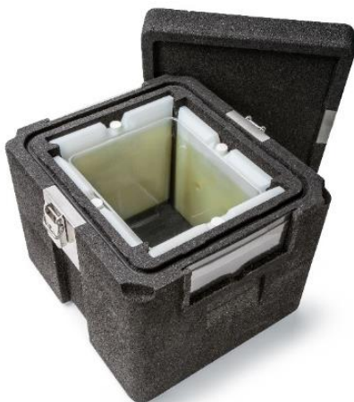
Figure 02: The Clinic-System is suitable for the temperature-controlled transportation of vital, temperature-sensitive medications within hospitals.