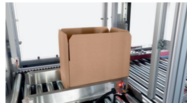
1. AUTOMATIC DETECTION OF BOX FORMAT