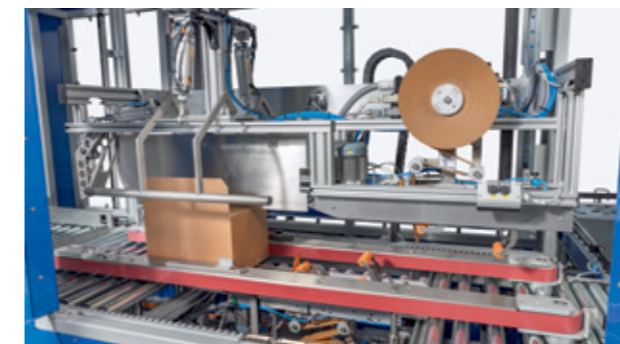
2. FOLDING OF LID FLAPS