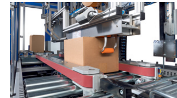
3. SEALING WITH SELF-ADHESIVE TAPE, WATER-ACTIVATED TAPE, OR HOT-MELT ADHESIVE