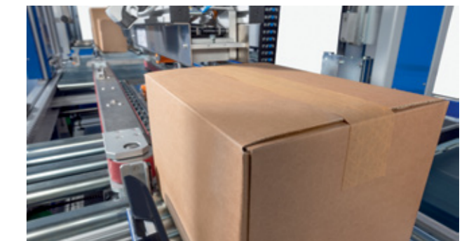
4. THE SEALED BOX IS READY FOR FURTHER PROCESSING